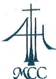
2017 Proposed Advent & MCC budget

Just as we invite you to tithe or percentage giving, Advent has defined that 15% of our income goes beyond our doors to other ministries we support. Half is for the South-Central Synod of Wisconsin, which helps advocacy, campus ministry, seminarians, and the shared work of our bishop and her staff. Of that, more than half goes to the Evangelical Lutheran Church in America (ELCA) and includes world hunger, ending malaria, disaster relief, new church starts, and much more. The other 7.5% is shared for jail ministry, ecumenical work, helping the homeless, aiding families and refugees, and other vital projects.